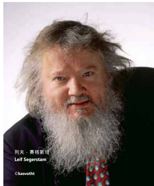
列夫·赛格斯坦 Leif Segerstam

Sibelius: Symphony No.2 in D major, op.43