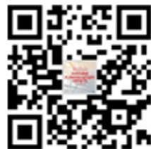
国家大剧院管弦乐团微博 China NCPA Orchestra Weibo