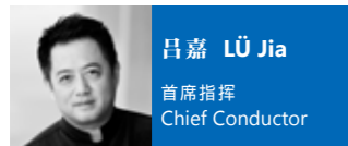
吕嘉 LÜ Jia 首席指挥 Chief Conductor