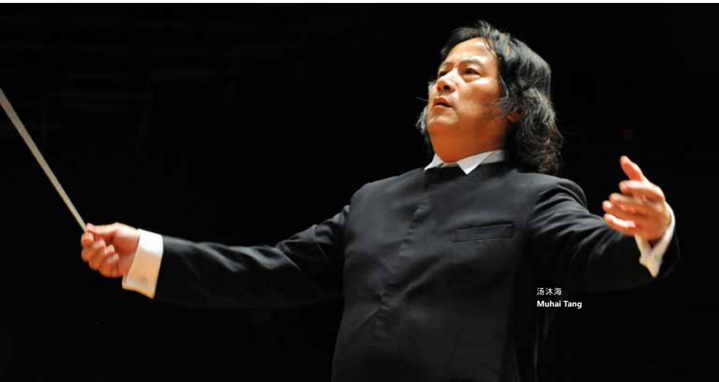
汤沐海 Muhai Tang

Prokofiev: Symphony No.1 in D major, op.25