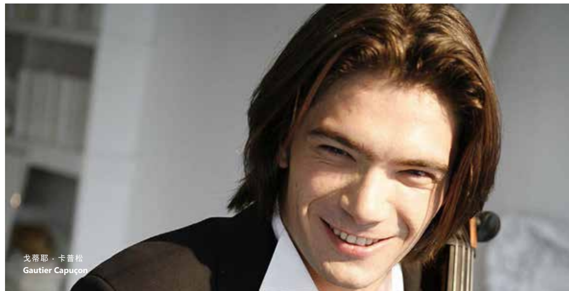
戈蒂耶·卡普松 Gautier Capuçon

Brahms: Symphony No.2 in D major, op. 73