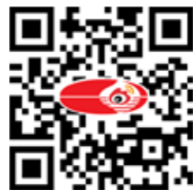
国家大剧院微博 NCPA Weibo