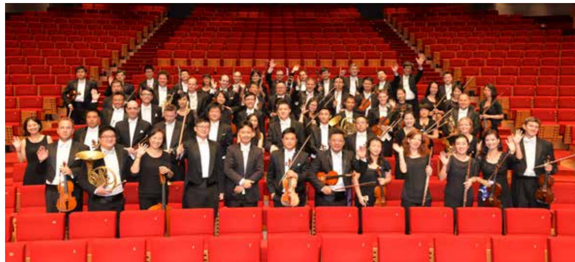
澳门乐团 Macao Orchestra

本场音乐会中，吕嘉将带领国家大剧院管弦乐团和澳门乐团为我们带来古斯塔夫·马勒的第三交响曲。作为两个乐团的首席指挥和音乐总监，此次吕嘉与两个乐团组成的联合乐团共同演绎这部巨擘之作，对于中国的观众是一次难得的音乐体验。