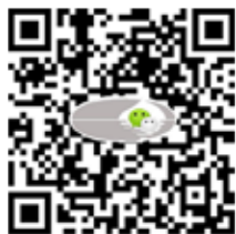
国家大剧院微信 NCPA Wechat