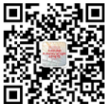
国家大剧院管弦乐团微信 China NCPA Orchestra Wechat