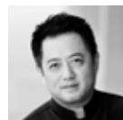
吕嘉 LÜ Jia 首席指挥 Chief Conductor