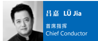
吕嘉 LÜ Jia 首席指挥 Chief Conductor