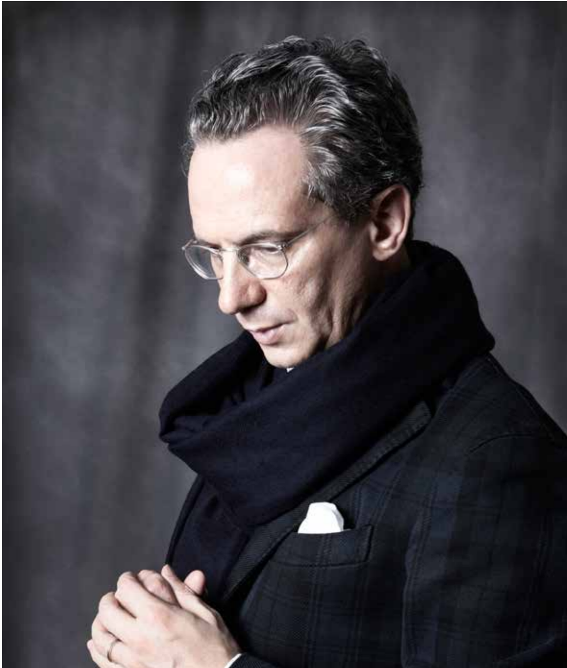
法比奥·路易斯 Fabio Luisi