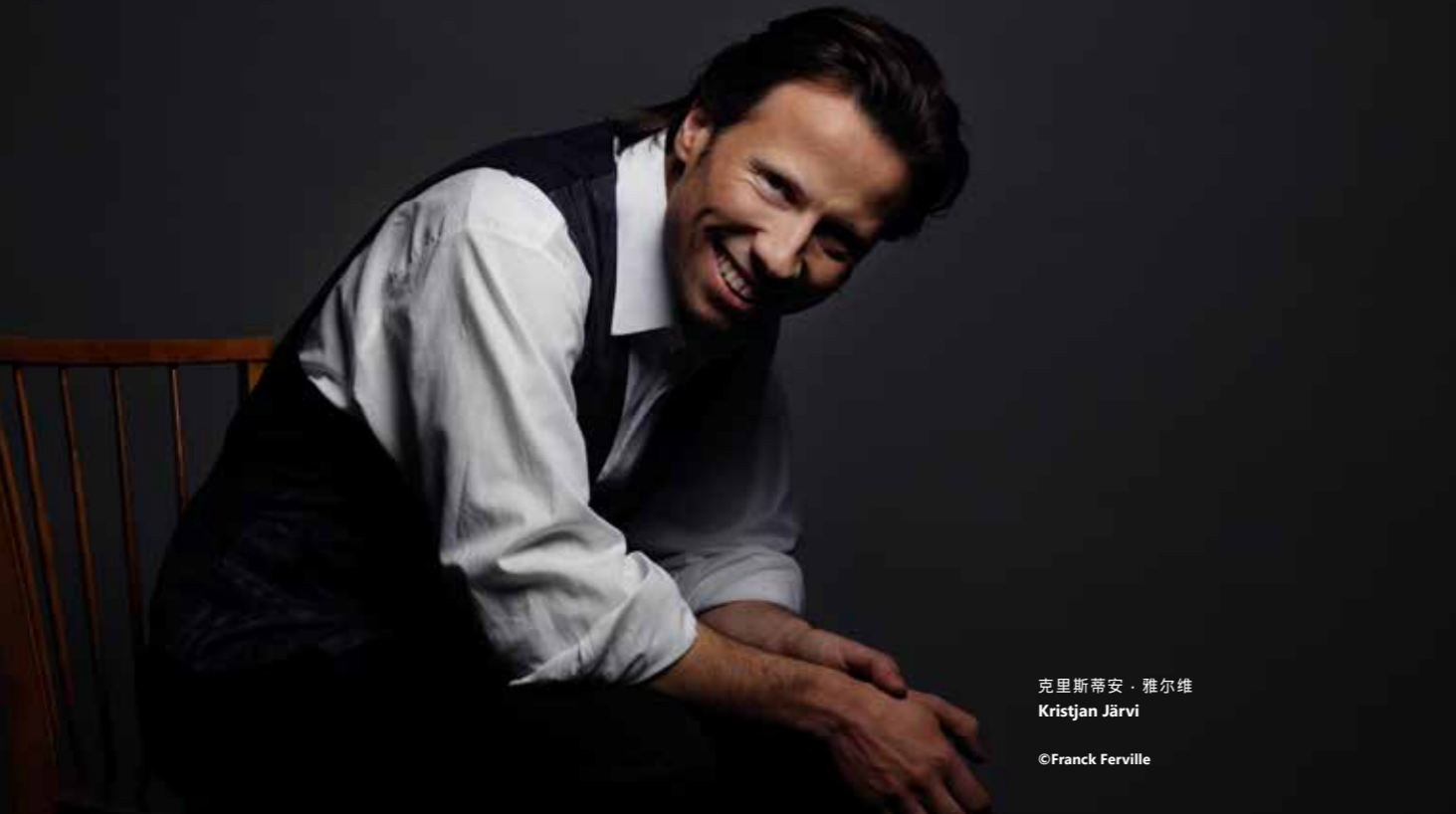
克里斯蒂安·雅尔维 Kristjan Järvi