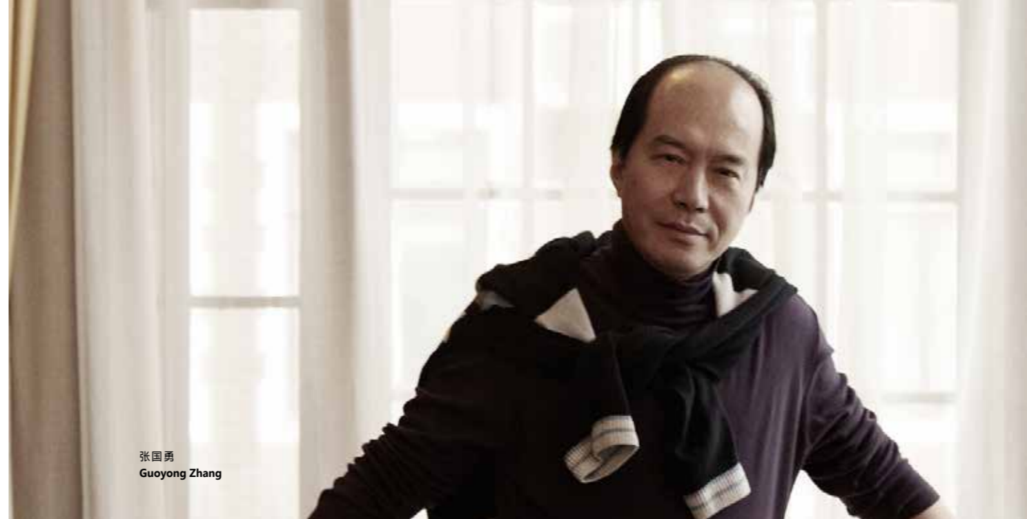
张国勇 Guoyong Zhang

本场音乐会始自肖斯塔科维奇于 1957 年为他儿子马克西姆 19 岁生日而作的 F 大调第二钢琴协奏曲。该曲也是由马克西姆在莫斯科音乐学院毕业期间首演。本场音乐会为我们担任钢琴独奏的是阿列克谢·沃洛丁，他曾在 2003 年荣获苏黎世第九届盖扎安达国际钢琴比赛首奖。