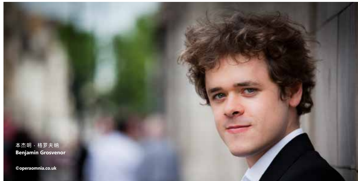
本杰明·格罗夫纳 Benjamin Grosvenor

Schubert: Symphony No. 9 in C major, D 944 ( The Great C major )